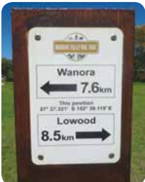
Good directional signage at Fernvale

Scale 1:100,000 (1cm = 1km) Contours 50m : 200m Km 1 2 3 4