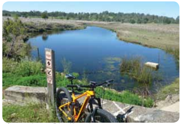
Concrete culvert near Fairney View station