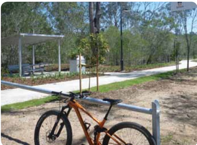
Brassall Bikeway near Wulkuraka Station and the start of the Brisbane Valley Rail Trail

The Lloyds Road crossing over the Brisbane Valley Highway at Wanora is a challenge, but applying common sense and care will ensure a safe crossing.