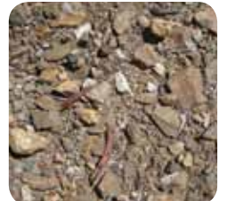
The surface of the trail changes from sand to gravel to rocky ballast.