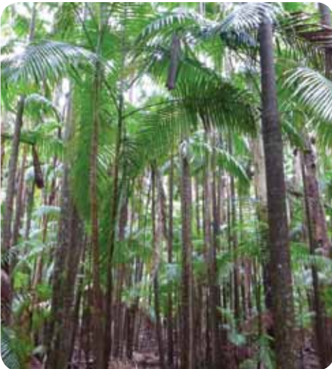
Piccabeen or Bangalow Palms from the boardwalk

Flooded Gum, very similar in appearance, has wider leaves, flowers from April to August and has cone-shaped gumnuts. It is named because the rough bark skirt at the base gives the impression of the debris line left after a flood.