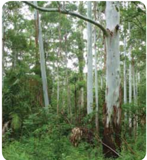
Sydney Blue Gums at The Gantry Day Use Area